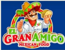
El Gran Amigo Mexican Restaurant Oscar Palomino