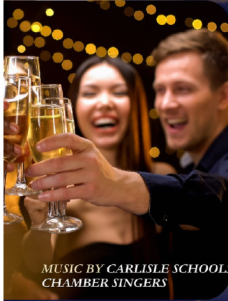
MUSIC BY CARLISLE SCHOOLS CHAMBER SINGERS