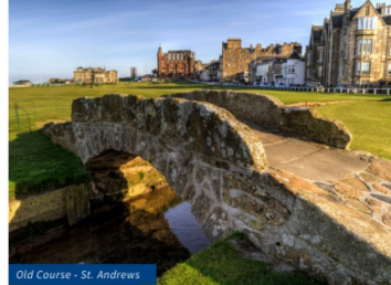
Old Course - St. Andrews