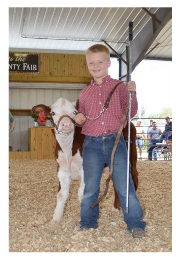
Families, Parenting Skills, Value Added Agriculture, Conservation, Sustainability, Business & Industry Programs

Make an informed decision. Watch for more information on this important issue.