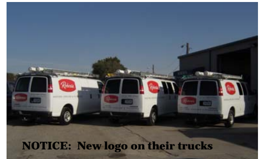
NOTICE: New logo on their trucks

Give Roberts a call at 515.989.0106. They will be happy to give you an estimate for your heating, cooling or plumbing needs.