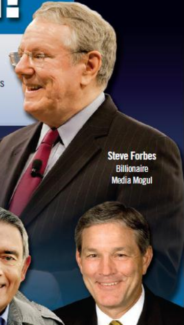
Steve Forbes Billionaire Media Mogul

Chairman and Editor-in-Chief of Forbes Media, Steve Forbes is the nation's foremost expert on business trends and economic growth. In this incredible session, he will reveal How to Leverage Economic Conditions to "Make the Sale", How to Balance Your Personal and Professional Priorities, Strategies that Thriving Corporations Use to Stay Ahead of the Pack, as well as How to Get Ahead and Stay Ahead.