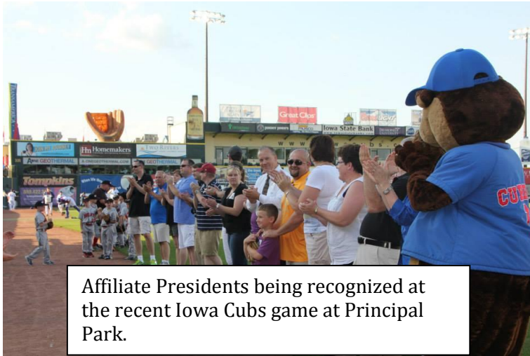
Affiliate Presidents being recognized at the recent Iowa Cubs game at Principal Park.

FUN at Chamber Night at Principal Park !!