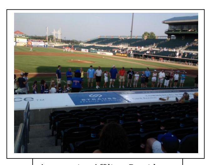
Announcing Affiliate Presidents