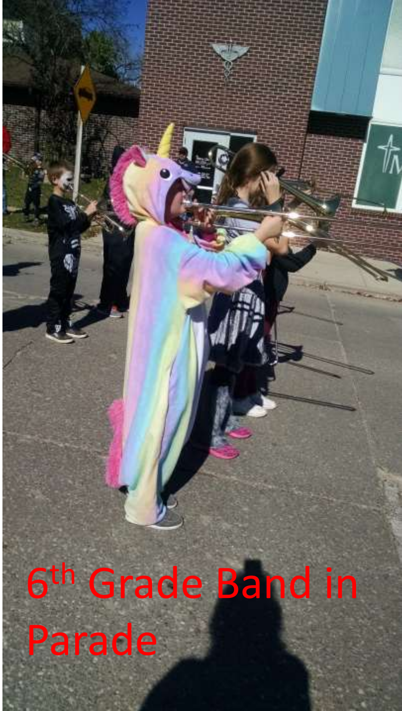
6 th Grade Band in Parade