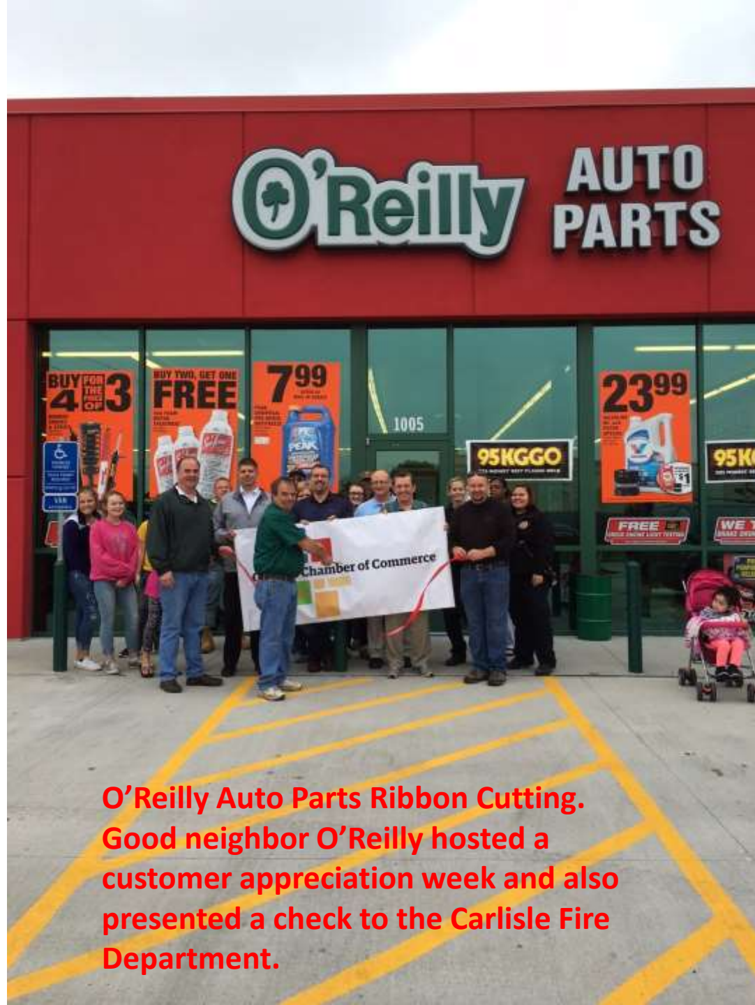
O'Reilly Auto Parts Ribbon Cutting. Good neighbor O'Reilly hosted a customer appreciation week and also presented a check to the Carlisle Fire Department.