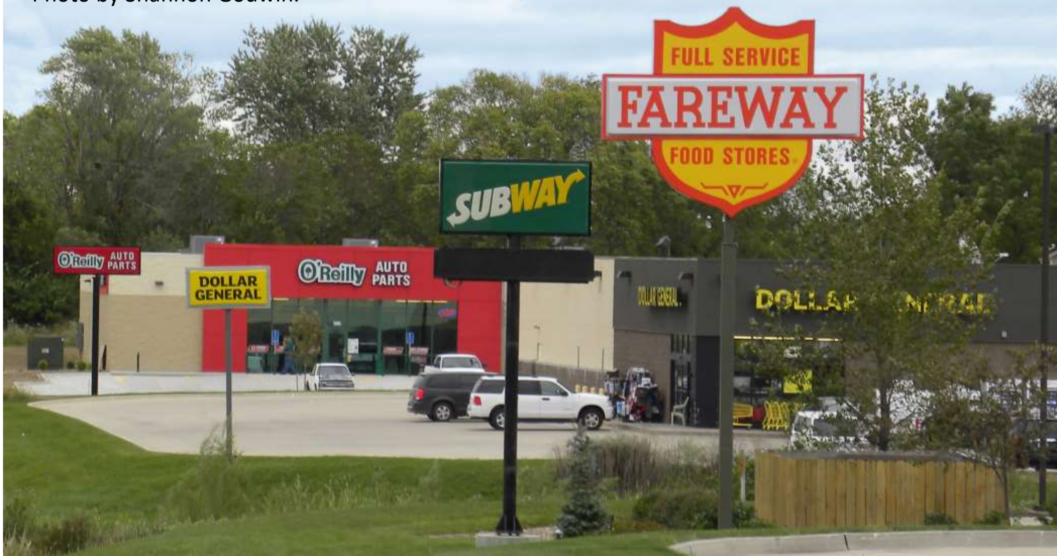
Commercial Skyline in Carlisle.