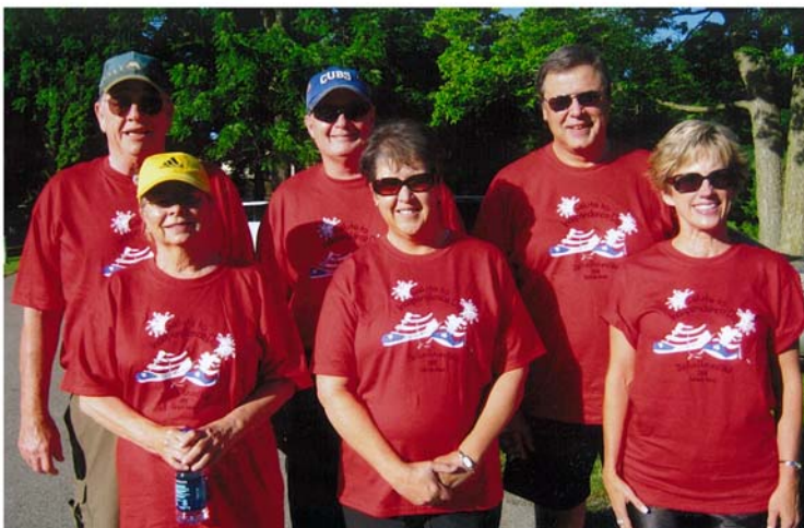
The above pictured participants were a part of the group that proudly represented Carlisle under the alias, Mayors Team 55.

Ankeny’s Kickin’ A’s, shedding a total of 84 pounds, and the Downtown Events Group, with an average of 6,437 minutes of activity per person, have been named the winners of the Do More Chamber Challenge.