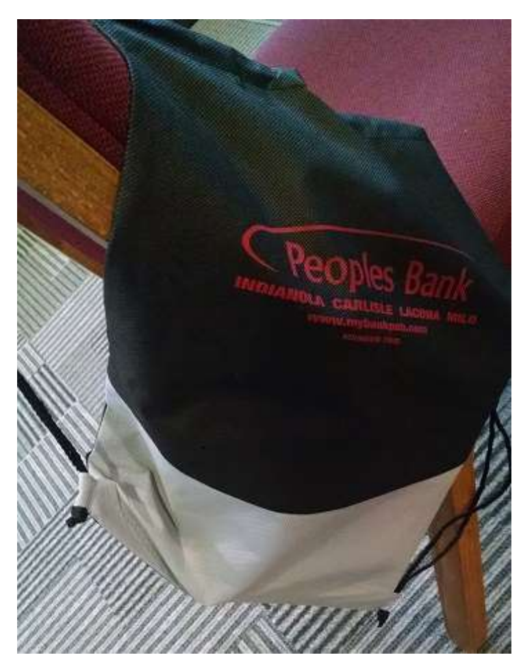
Peoples Bank provided these bags for Welcome Packs.